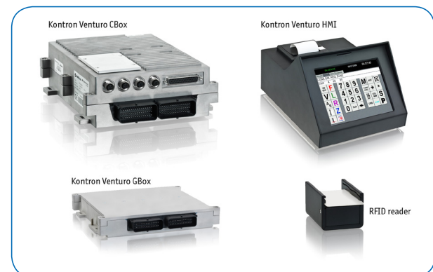
Image 2: The components of the vehicle management system from Kontron: The central computer is connected to the driver's console, GSM Voice & audio box and RFID reader.

An essential advantage for the engineers at SRWT/TEC was the fact that they could speak directly with Kontron's developers and quickly get substantial answers to all the requirements and questions, such as those concerning an optimized system design for shortest Mean-Time-To-Repair (MTTR). TEC/SRWT was able to undertake the programming of application software for the new systems thanks to evaluation boards that Kontron was able to provide which functionally represented the management system at an early phase in the project. Because of this efficient work flow, the "Venturo" systems were announced in 2010. The integration of the management system into the vehicles will be handled by the joint venture partner Fabricom-GTI in the respective TEC depots.