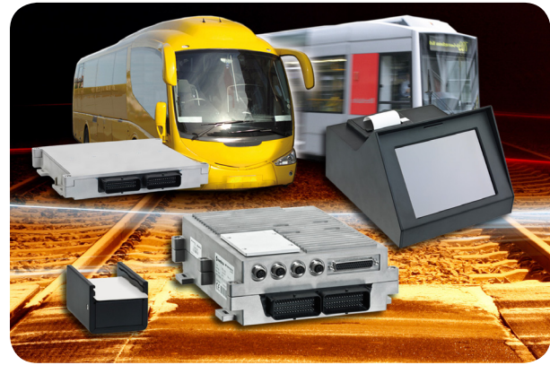
Image 1: The vehicle management system of the TEC/SRWT for buses and trams is a central, multifunctional embedded computer with connected peripherals consolidated.

In the announcement phase, SRWT/TEC examined different proposed system solutions. Most of these solutions, however, did not offer all the required functionalities. Others argued for distributed computing systems that led to high hardware implementation while currently lacking possible hardware consolidation. Overall, these solutions involved additional costs and maintenance. Therefore the decision was between solutions leading to extensive adjustments or solutions offering open custom designs, tailored to meet current needs and open for future ones, as presented by Kontron with its embedded computing platforms. Kontron was already known by SRWT/TEC as an experienced supplier for the transportation market. Additionally, because of extensive ODM services for custom system development, Kontron was in a position to not only develop and produce the board computer, but also the peripherals such as the driver console and RFID badge