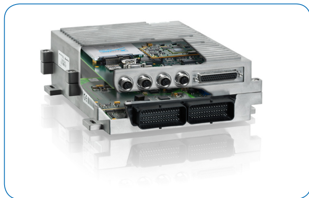
Image 3: The board computer Kontron Venturo CBox is based on a Kontron nanoETXexpress-SP Computer-on-Modules and two application-specific carrier boards..

The interfaces of the board computer are ergonomically designed. The three connectors for WLAN, GPS and GSM antennas are placed on the opposite side of the housing from where all the other connectors are located, allowing for orderly cabling. A rugged, 90 pin, IP68 protected automotive connector handles all I/Os (CAN-Bus, 12 x EN50155 compliant RSxxx 12x, 4 x RS232, and 12 EN50155-compliant digital I/Os) as well as the power supply. Fast Ethernet channels can be connected over four M12 connectors and a 50-pin DSUB connector binds all communication signals and the power supply to the driver's console via a single cable of up to 15 meters in length. This concept reduces the number of interface connectors accelerating both the removal and the installation of the systems and therefore reducing maintenance times. However, with a MTBF of 80,000 hours in a temperature range from -25 °C to +70 °C, this should only rarely be necessary.