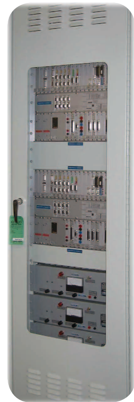
Fig. 2. One of the rugged Kontron PDCs for monitoring safety critical values in the CANDU reactor.

Maintenance and Diagnostic system at any time to ensure the functionality of newly delivered boards and to check the functionality of the boards in any of the PDCs. The boards to be checked are placed in the Maintenance and Diagnostic system's 19" rack. Specially developed diagnostic software, written and supplied by Kontron, runs on the system's VM30 board under OS-9 RTOS. A user interface is provided by the robust Kontron VL203 server with Intel processor together with a TFT graphic terminal and keyboard. Emulation software running on the VL203 under Windows OS guides AECL operators through the diagnostic procedures. By selecting the relevant menu options, operators are able to check the functionality of all SDS 2 components. For example the Kontron VME processor boards, including the VM30 real-time clock and timer as well as dynamic RAM, static RAM and the contents of VM30 EPROM. Operators can also check the functionality of all the digital and analog I/O boards as well as the watchdog.