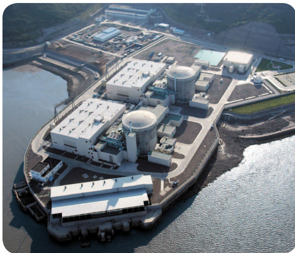
Fig. 1. The Safety Shutdown System 2 (SDS 2), based on proven VME technology, monitors safety critical parameters at the Qinshan Phase III Nuclear Power Station in China.

In order to operate safely, nuclear power stations require high availability safety systems. One company at the forefront of research into nuclear safety is AECL. Established in 1952, AECL is the designer and builder of the CANDU® (Canada Deuterium Uranium) technology including the CANDU 6® reactor, one of the world's top performing nuclear power plants. The reactor's safety features include two highly reliable Safety Shutdown Systems (SDS1 and SDS2), designed to shutdown the reactor on detection of abnormal conditions. For SDS2 AECL has chosen a system based on the long-standing and proven VME technology.