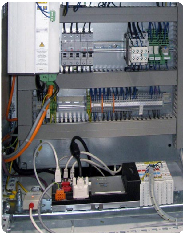
Figure 2 The Kontron ThinkIO-Duo provides standard PC connectivity as well as industrial fieldbus and industrial Ethernet interfaces in a single, ultra-compact unit.

Two digital cameras mounted behind the goal line each take around 40 pictures per second. This enables the system to follow the flight curve of the ball from the moment it is struck. Each camera has its own connection to one of the